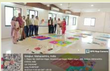
30th July - Rangoli Competition Theme, My Health My Right at DHB Soni College