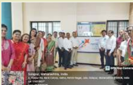
30th July - Poster Competition at DHB Soni College, My Health My Right