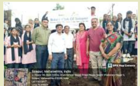
30th July - Tree Plantation