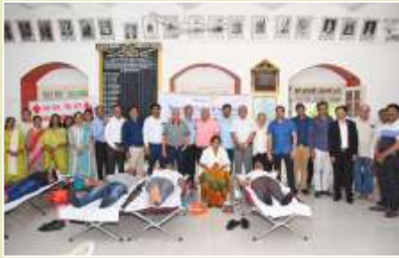
1st July - Blood Donation Camp was organized at Masonic Hall and Kondi, 56 donors donated the blood.