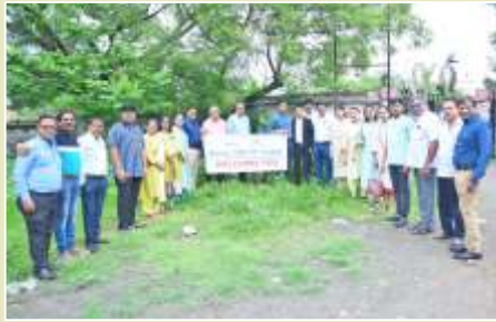
1st July - Tree Plantation was organised at Masonic Hall, 11 trees were planted by our club members.