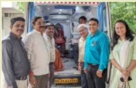
3rd July - Eye and Dental Check Up camp at PP Patel Factory Tamalwadi