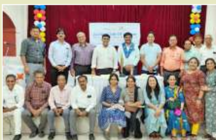
12th July - Weekly Meeting Strategy