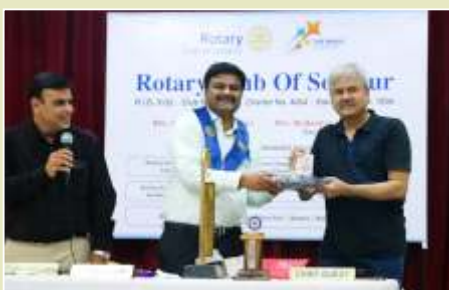
26th July - Weekly Meeting Union Budget 2024