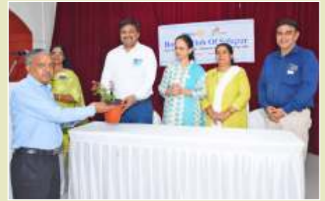
1 st July - Doctors / CA / Agriculturalist Day