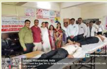
30th July - Blood Donation Camp at DHB Soni College