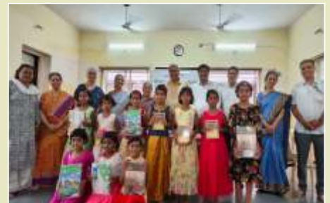
3rd July - Educational Kit Distribution at BC Girls Hostel, Solapur