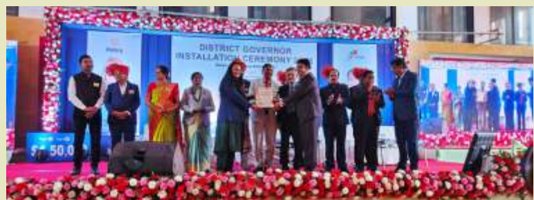
Our Club got felicitated with Membership Award for Membership Growth at DG Installation Function